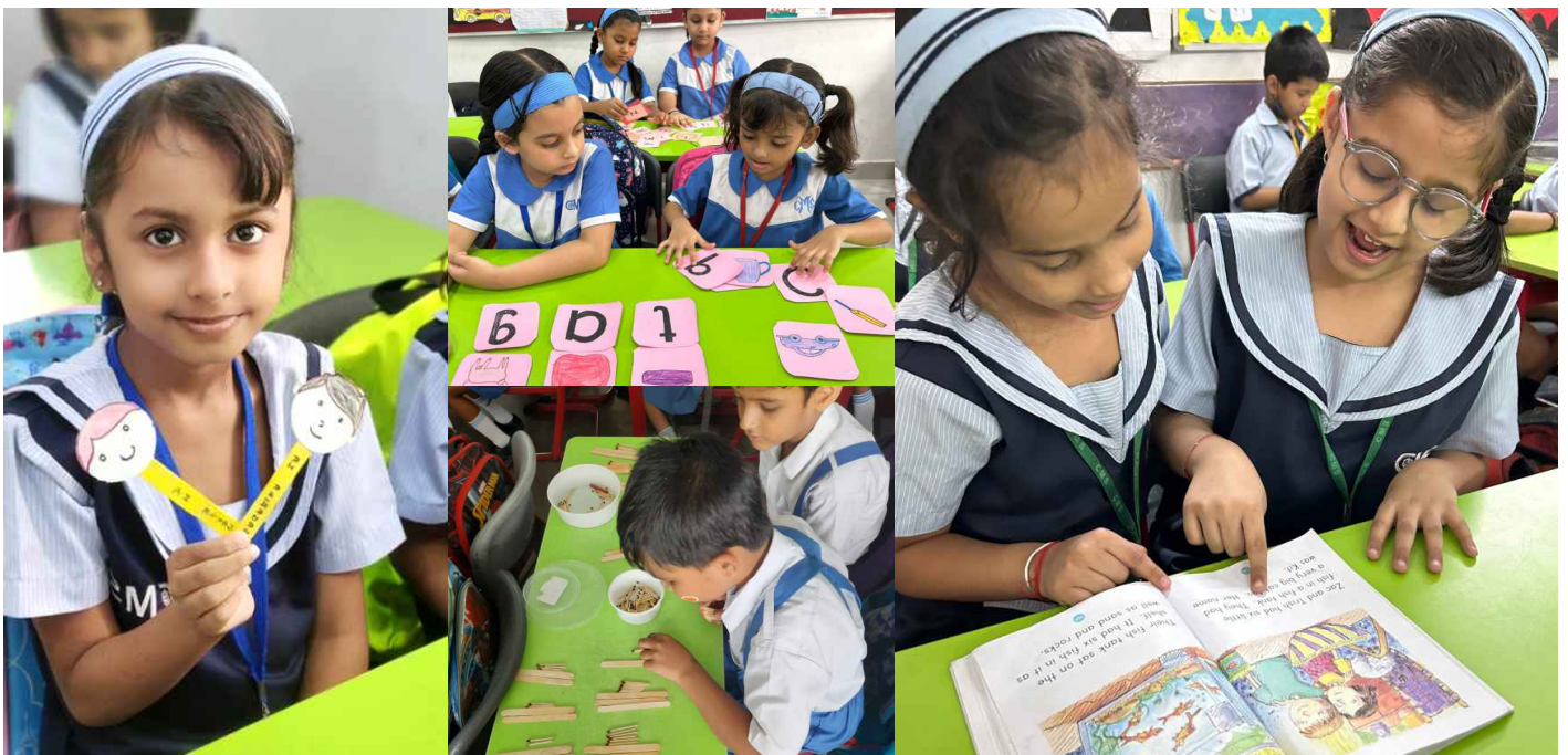
A learner-led classroom — pairs and groups, every child active.

Most training fades within weeks. This stays —because you leave with a practice you can lead yourself, and a community to lead it with. The transformation outlasts the two days.