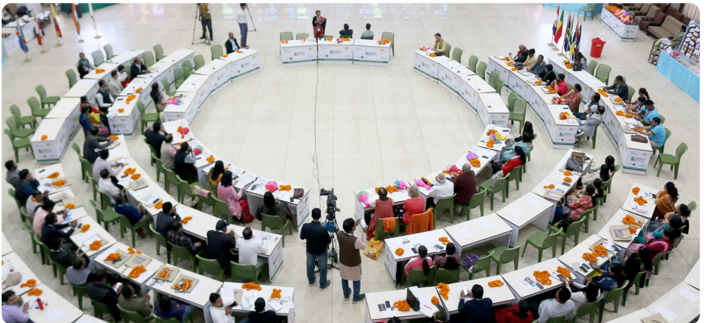
The Circle - leaders from across India and the world, learning together.

Complete both days and leave a Certified PATH Leader — ready to lead the change and guide your own team.