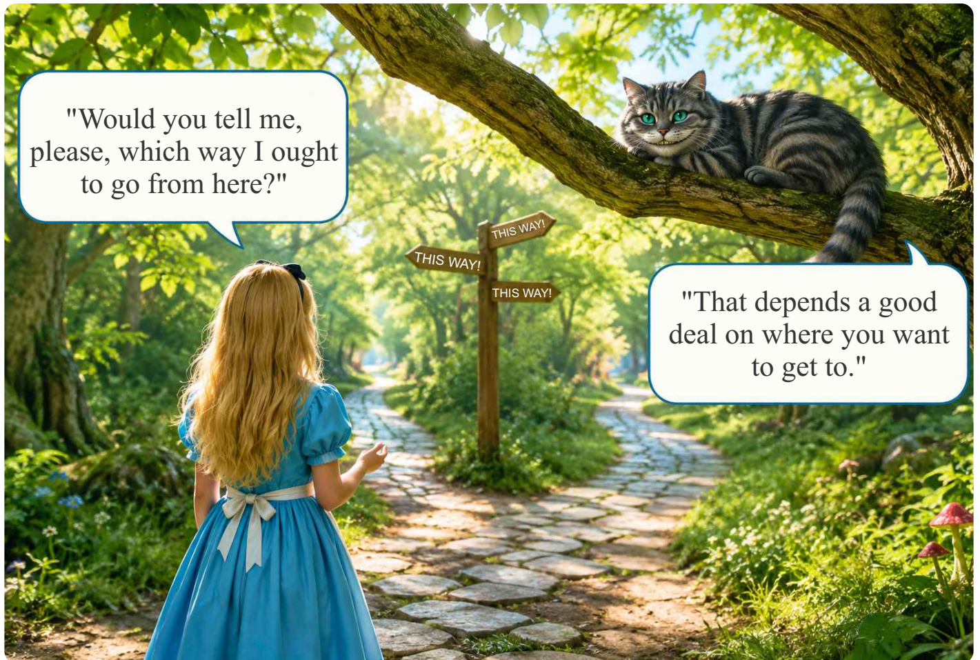
Lewis Carroll, Alice's Adventures in Wonderland (1865) — Alice and the Cheshire Cat at the crossroads.

The Cat's lesson is simple: if you do not know where you are going, any road will do. For too long, education has wandered without naming its destination. A school that knows where it is headed chooses its road with purpose — and moves.